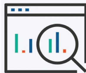
Cost & Usage Analysis