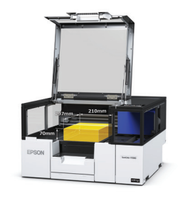
Print on 3D objects, up to 70 mm thickness