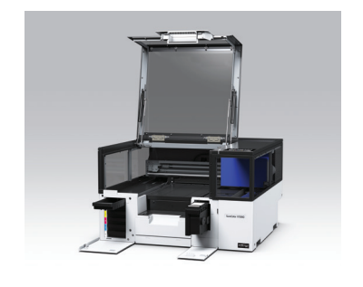
Complete front operation