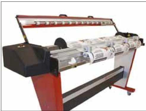
Very simple to load and operate

The WR64 can cut most flexible materials, as an option it can be equipped with an automatic side sensor, that will compensate for tapered or poorly wound rolls.