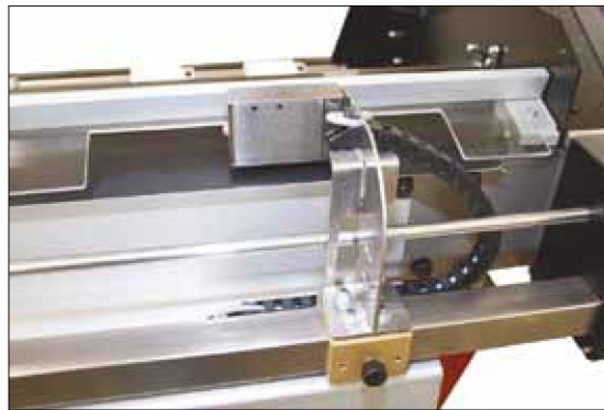
The optional side sensor will compensate for inaccurately wound rolls.