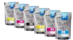
Advanced UltraChrome DS ink ships in cost-effective 1/1.1L packs