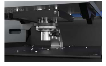
Interchangeable Platens with Enhanced Height Adjustment and Optical Sensing