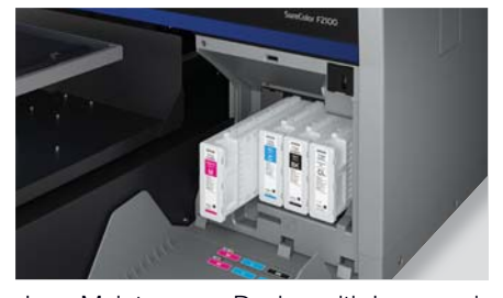
Low Maintenance Design with Improved Self-Cleaning Print Head and new Auto Cap Washing system