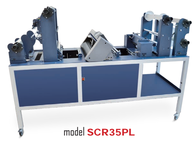
The perfect match for wide-format digital color label presses

The Scorpio Series are all-in-one systems that unwind, laminate with laminate liner rewind core holder for labels added durability (only SCR22PL and SCR35PL), digitally die-cut, remove the excess label material around each die-cut shape, slit, and rewind offering you everything to professionally cut and finish labels.