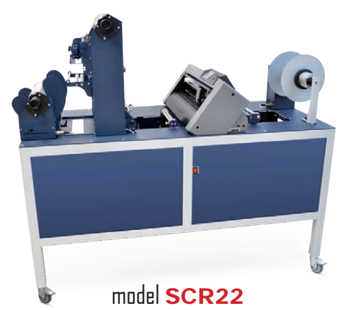
The digital label finisher with no lamination module ideal for those who use pigment-based ink / laser technology printers (water and fade resistant).