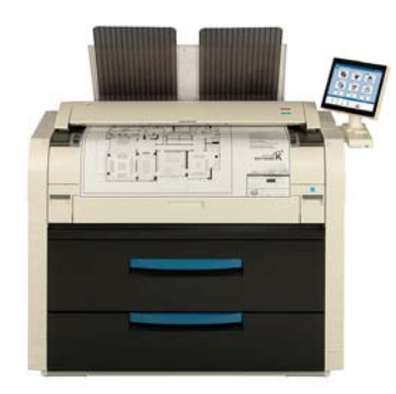
KIP 7580 multi-function system with integrated CIS scanner & top stacking print tray