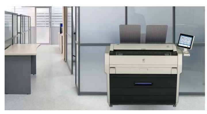
Space Saving Footprint | Installation Simplicity Compact mechanical design with ease of serviceability as an engineering priority.