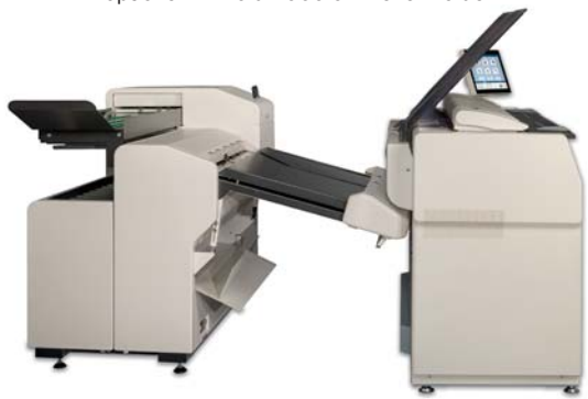
KIP 7170 production system with optional KIPFold 2800 online fan folder