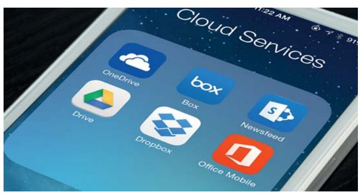
KIP Cloud Connect Sharing online content via popular Cloud Services has become a critical collaboration tool. Scan to and print from the cloud directly at the multi-touch display.