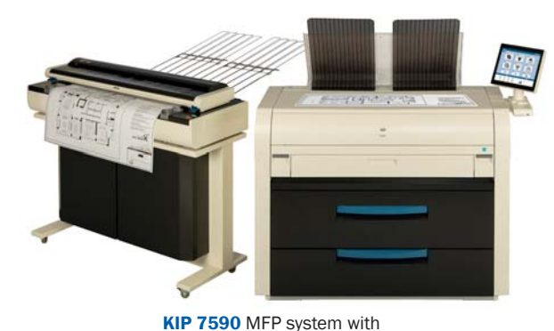
KIP 2300 CCD production scanner