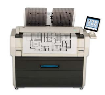
KIP 7170 multi-function system with integrated top stacking print tray