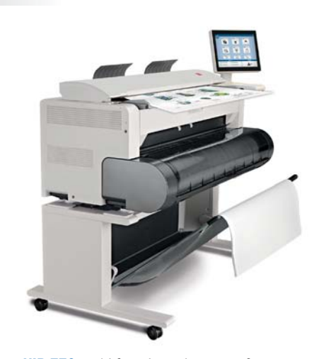
KIP 770 multi-function print, copy, & scan system (with included colour scanning)