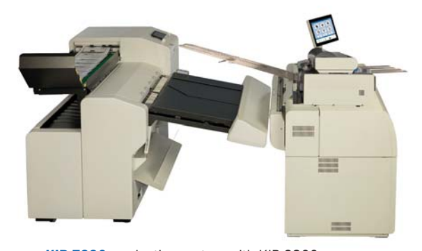
KIP 7990 production system with KIP 2300 scanner & optional KIPFold 2800 online fan & cross folder