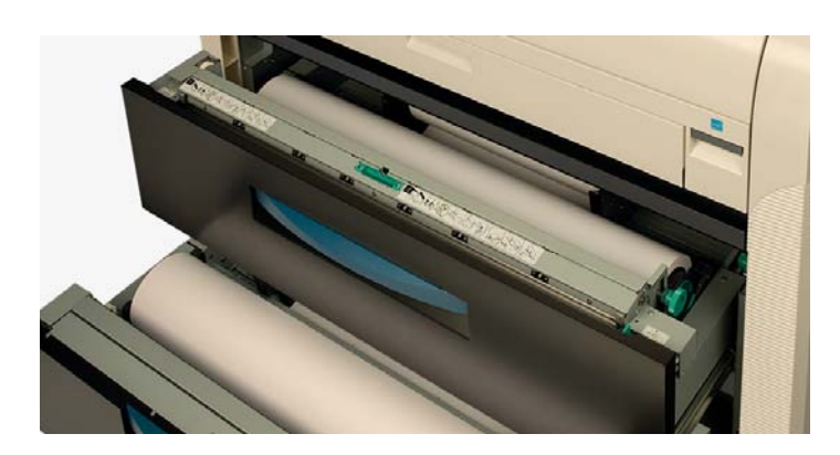
Quick Switch Technology The KIP 70 Series print technology eliminates roll switching delays for increased productivity. Two or four media rolls and a sheet feeder deliver mixed print sizes at full production speed.