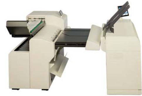
KIP 7570 print system & optional KIPFold 2800 online fan & cross folder