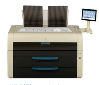
KIP 7970 network print system with integrated top stacking print tray