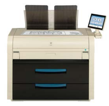
KIP 7570 network print system with integrated top stacking print tray