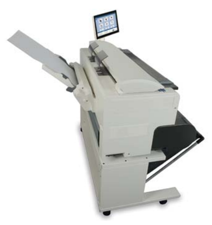
KIP 770 RC multi-function system with paper tray for cut sheet printing up to 420 mm x 594 mm