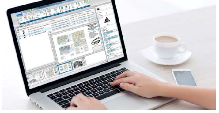
KIP Print Submission Designed for Windows® PC's, KIP PrintPro is an intuitive system management and print submission application for the complete range of black & white systems.