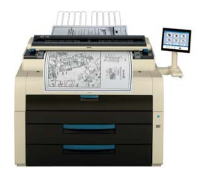
KIP 7990 MFP system with KIP 2300 CCD production scanner