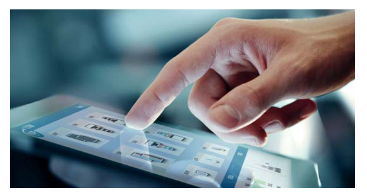
KIP Multi-Touch Touchscreen All system functions for the KIP 70 Series are performed through an integrated, 12" multi-touch style colour display to copy, print and scan.