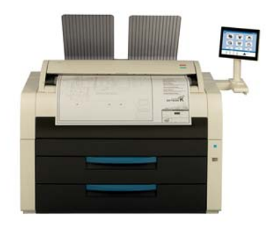
KIP 7980 multi-function system with integrated CIS scanner & top stacking print tray