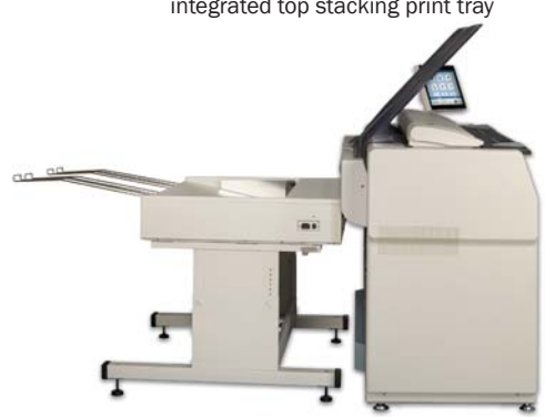
KIP 7170 production system with integrated top stacking print tray & optional KIP 1200 high capacity stacker