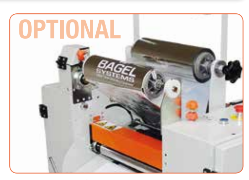
Digital HotStamp® module:

DIGIFAVB2 PRO is available with an optional pallet delivery pile system which can be unloaded using a shing and spot varnishing. hand pallet truck or forklift.