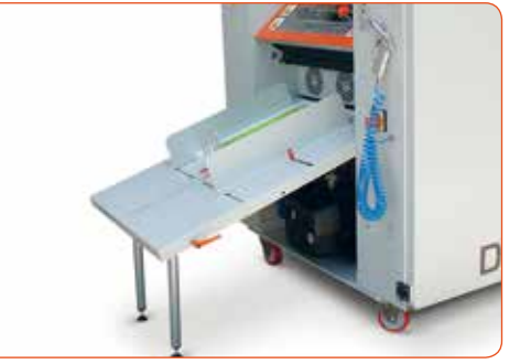
Delivery table with air fans.